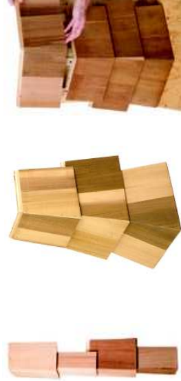
Flush 90 Corner Specialty Flared 135 Degree