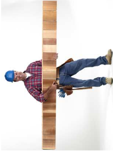
Panels are available in Even & Staggered Buttline, both with the Open Keyway shingle pattern.